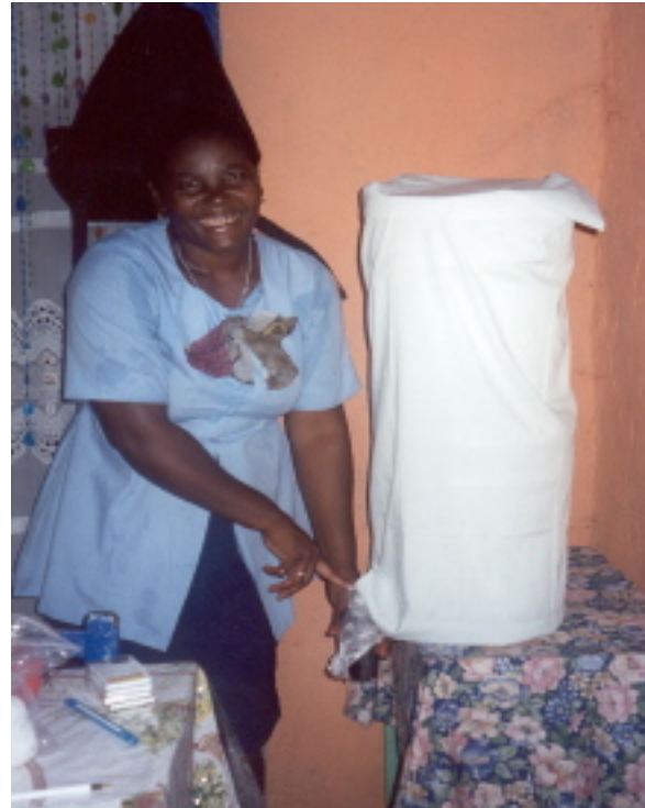
A GWI Technician with Filter