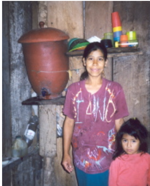
The PFP filter in use in rural home