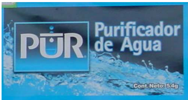
PUR Purifier of Water