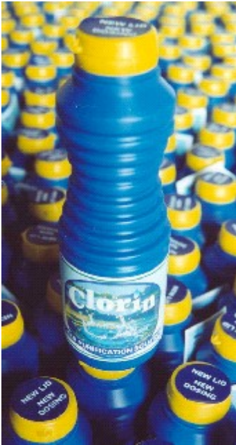
The PSI/Zambia Clorin Product