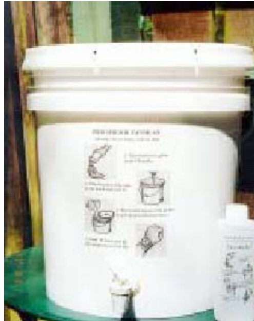
The Jolivet bucket and product