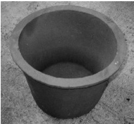
The PFP Filter