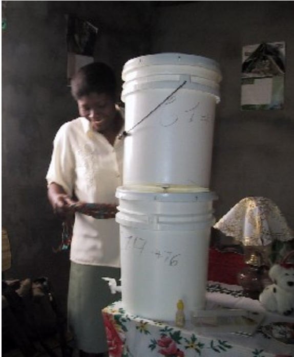
The GWI Filter in Haitian Home